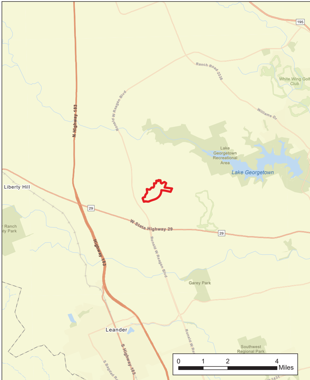
Williamson County MUD 19F Site Location Map