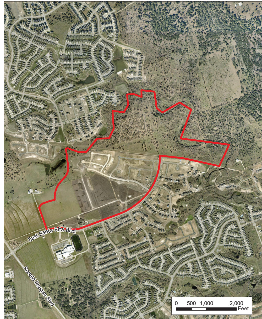
Williamson County MUD 19F Location Map

Carlson, Brigrance & Doering, Inc. shall not be liable for errors, omissions, or inaccuracies contained in this map. For informational purposes only. J:\AC3D\5004\GIS\Bond Issue Maps SRR\SRR Bond Issue PRO\SRR Bond Issue.aprx