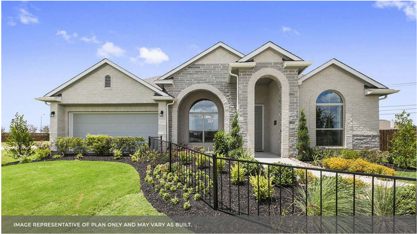
IMAGE REPRESENTATIVE OF PLAN ONLY AND MAY VARY AS BUILT.