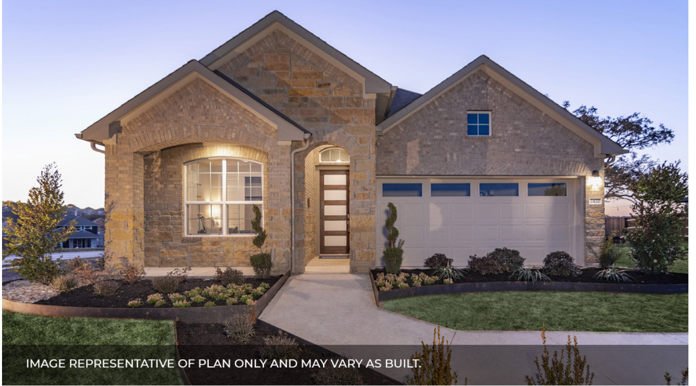
IMAGE REPRESENTATIVE OF PLAN ONLY AND MAY VARY AS BUILT.