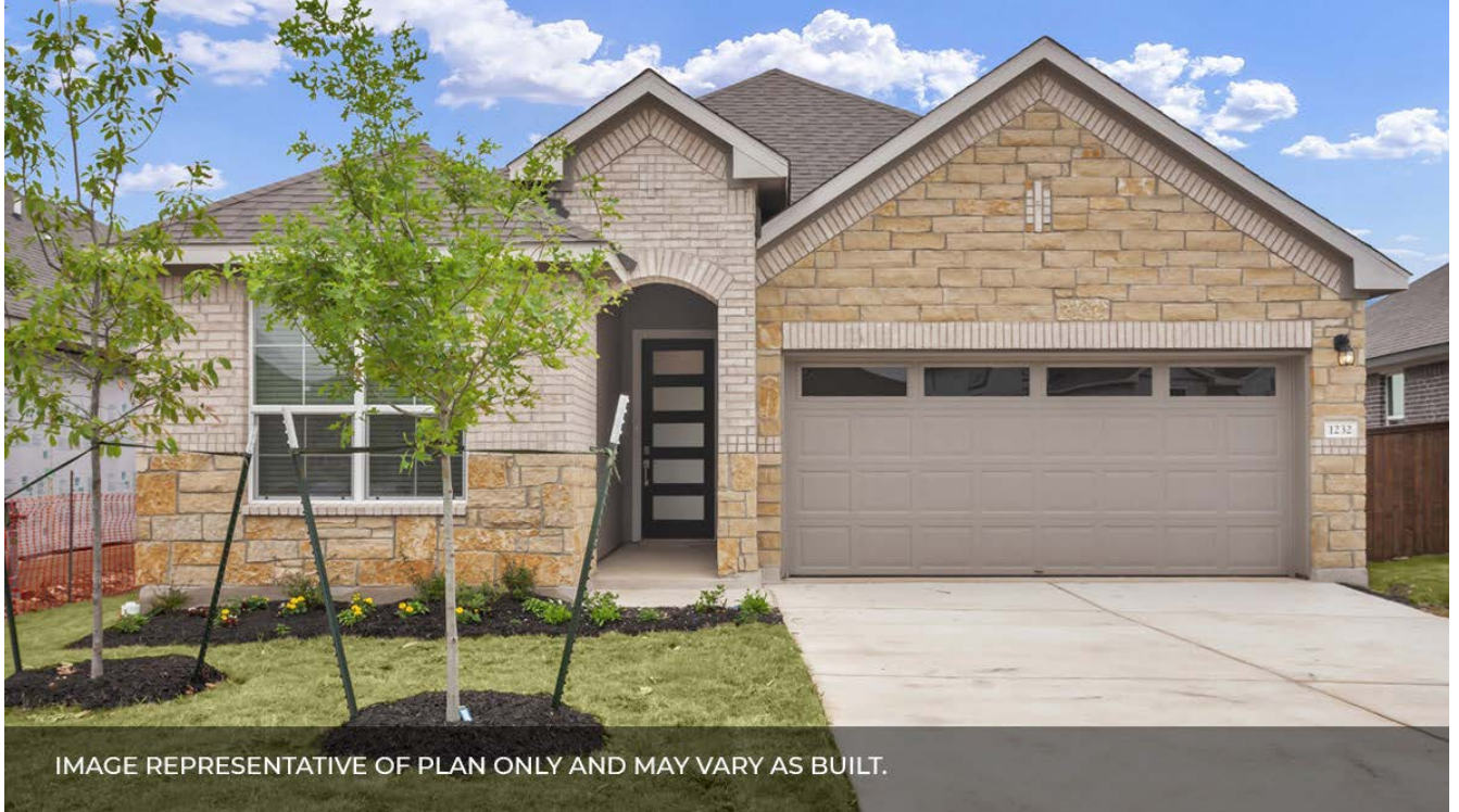
IMAGE REPRESENTATIVE OF PLAN ONLY AND MAY VARY AS BUILT.