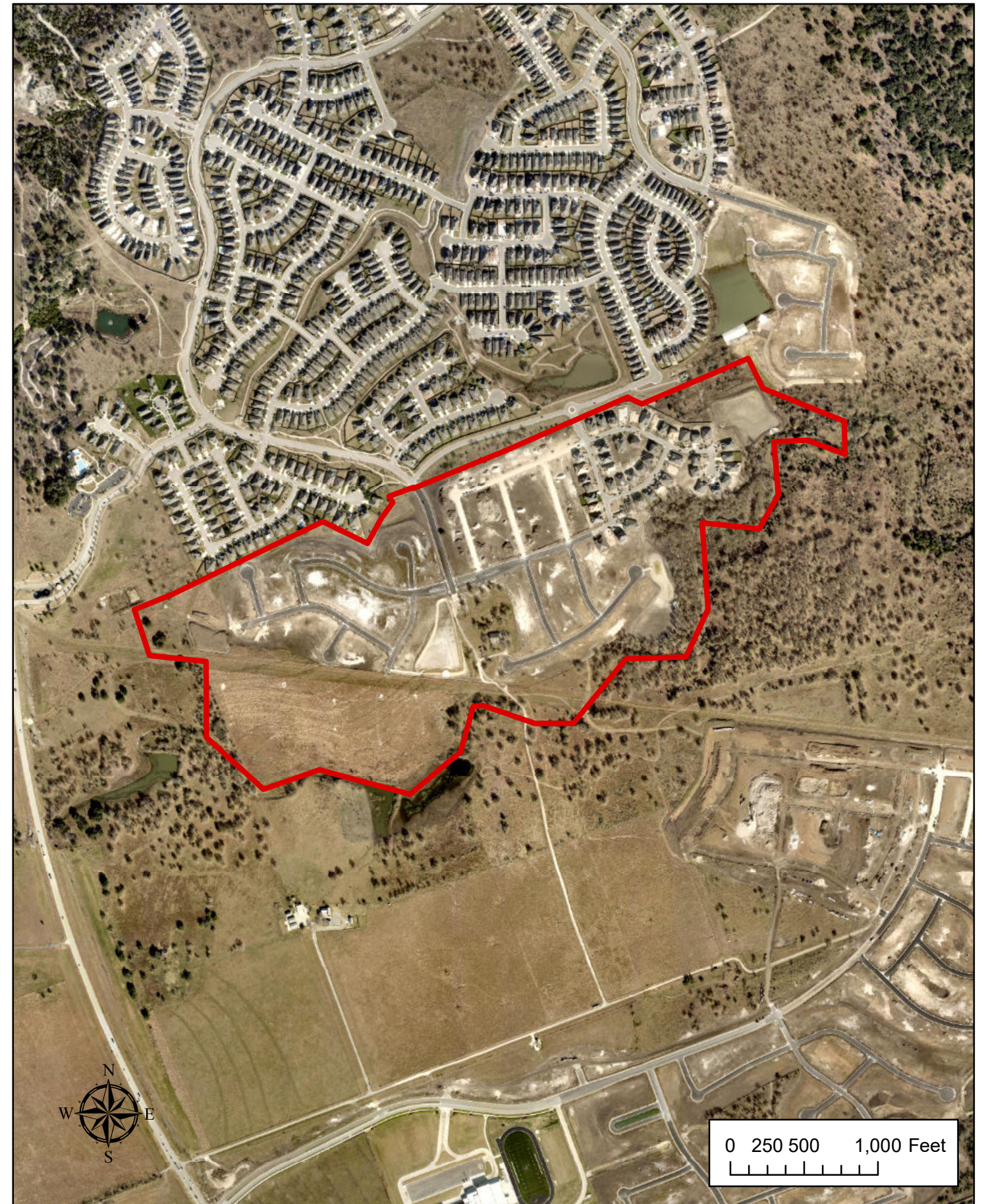
WC MUD 19B Location Map