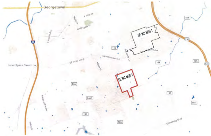
LOCATION MAP - SOUTHEAST WILLIAMSON COUNTY MUD NO. 1