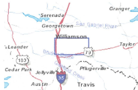
LOCATION MAP – SIENA MUD NO. 2