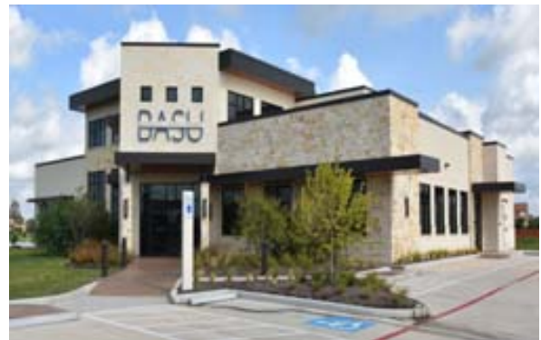
BASU Aesthetics & Plastic Surgery (MUD 501)