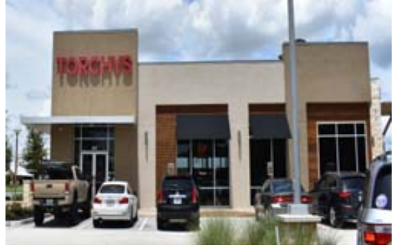
Torchy's Tacos (MUD 500)