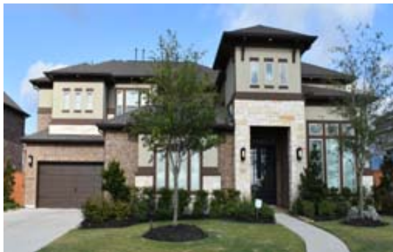
Single-Family Home (MUD 501)