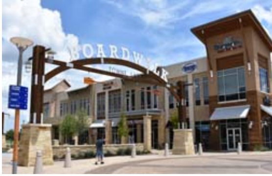
Boardwalk (MUD 500)