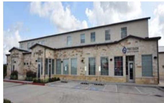
Eye Care, Orthodontics, Dental Specialists (MUD 501)