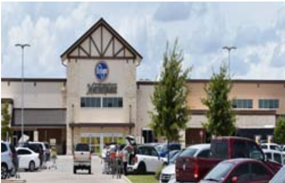
Kroger (MUD 500)