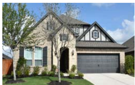
Single-Family Home (MUD 502)