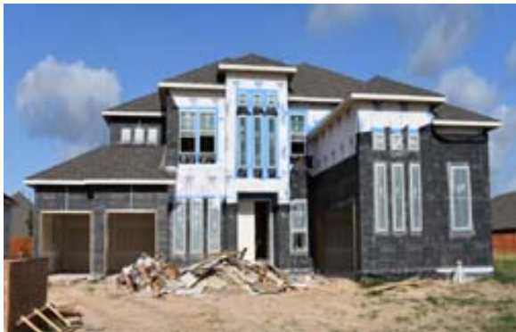
Single-Family Home Under Construction (MUD 501)