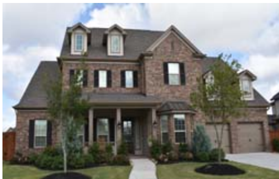
Single-Family Home (MUD 501)