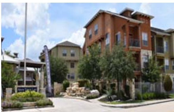
ARIUM Towne Lake apartments (MUD 500)