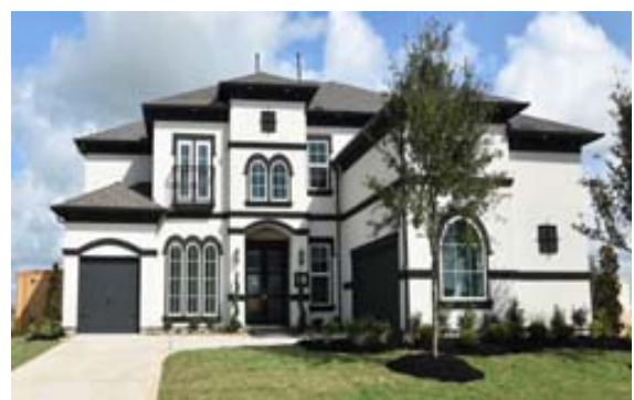
Single-Family Home (MUD 502)