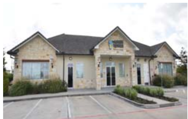
The Learning Experience (MUD 501)