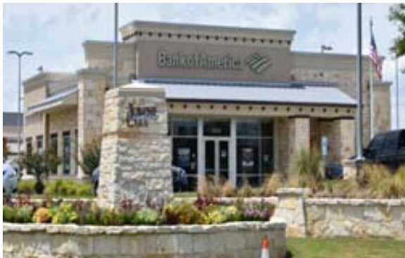
Bank of America (MUD 500)