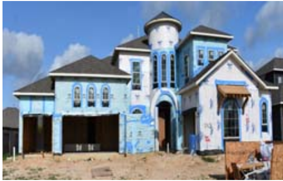
Single-Family Home Under Construction (MUD 501)