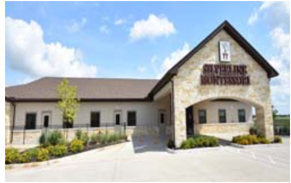
Silverline Montessori (MUD 502)