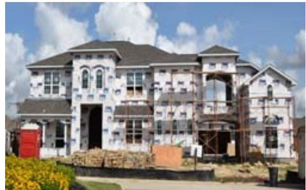
Single-Family Home Under Construction (MUD 502)