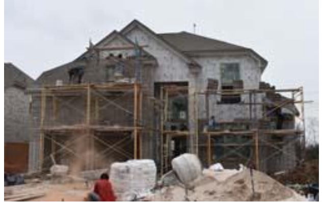
Single-Family Residential Under Construction