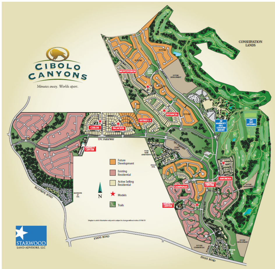
FIGURE 2 – DISTRICT MASTER PLAN