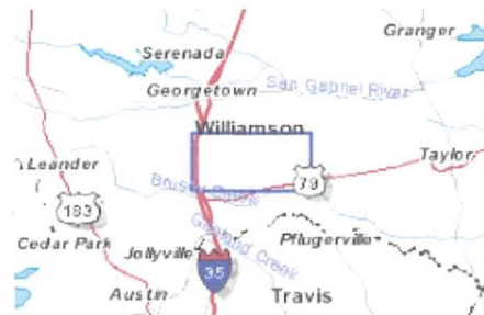
LOCATION MAP – SIENA MUD NO. 2