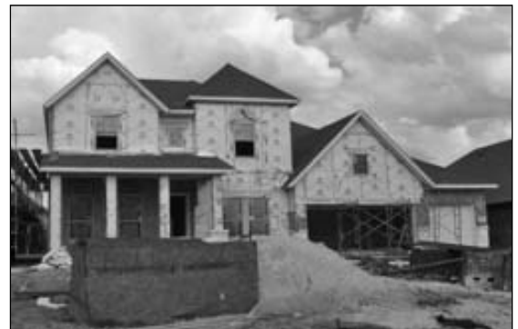
Single-Family Home Under Construction