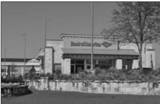
Bank of America