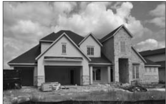
Single-Family Home Under Construction